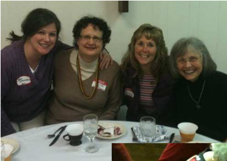
Presbyters enjoy the amazing Petersburg hospitality!